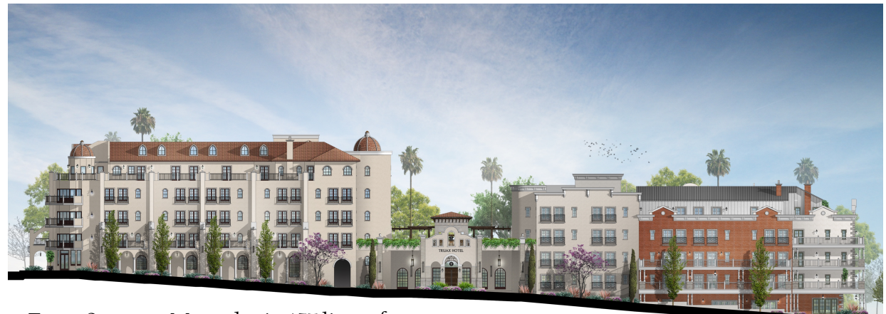
Front Street to Mercedes is 457 linear feet

Unique opportunity to become a part of this landmark hotel and parking garage that will be a showpiece for the continued development of Old Town Temecula. Investment range is $20m to $40M, depending on whether current LLC members continue with their investments .Construction has begun, and sponsor must replace construction lender due to lender's default. A blended terms sheet at 75% loan to cost is available. Additional financial information including sources and uses, cash flow, IRR and other informational material is available.